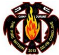
Conclave Delegate Patch