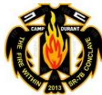
Conclave Trader Patch