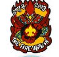
Mighty Cardinal Patch