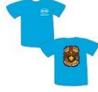
Mighty Cardinal T-Shirt